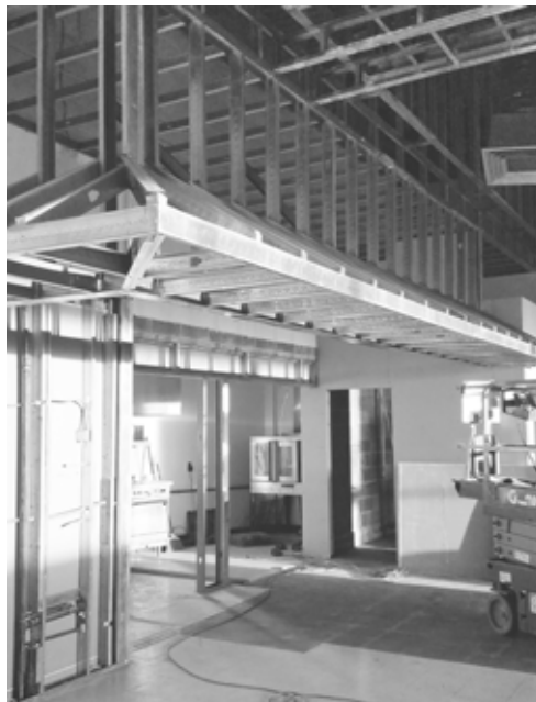
The new awning which will house recessed lighting is taking shape.