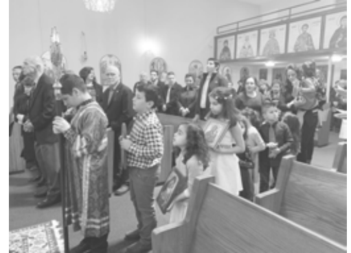
Sunday School children proudly display their icons during the procession in honor of The Sunday of Orthodoxy. This day signifies unity of Orthodox belief and the oneness of our Faith—across languages, continents, and centuries.