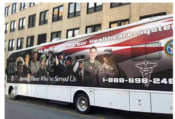
VETERANS AFFAIRS BUS WITH FRONT LINE WORKERS ROLLS INTO MANHATTAN.