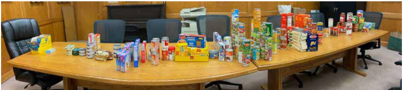
Teens counted and logged donations for the annual Food for Hungry People effort. Last year 100 parishes in our Archdiocese reported participating in this much needed program. Additionally, 58 Antiochian parishes participated all year long, and distributing 500,269 pounds of food within our communities.