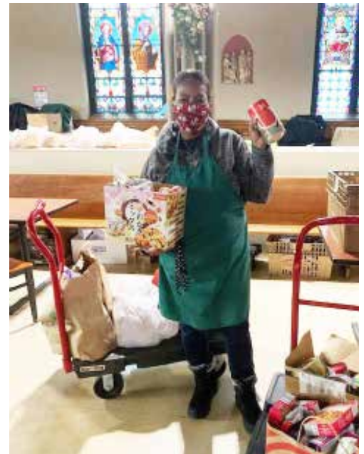
A worker at the Samaritan Center is pictured with food donations collected by Teen SOYO and the Antiochian Women. Donations were also delivered to the Jamesville-Dewitt Ecumenical Food Pantry and will be provided to We Rise Above the Streets.

With the year 2021 filled with only more compassion, love, support, and hope for the future, our Ladies Group is thankful for all that we have been able to accomplish and will always have you in our prayers. May you all have a blessed year, and remember to look to the Lord for all you need.